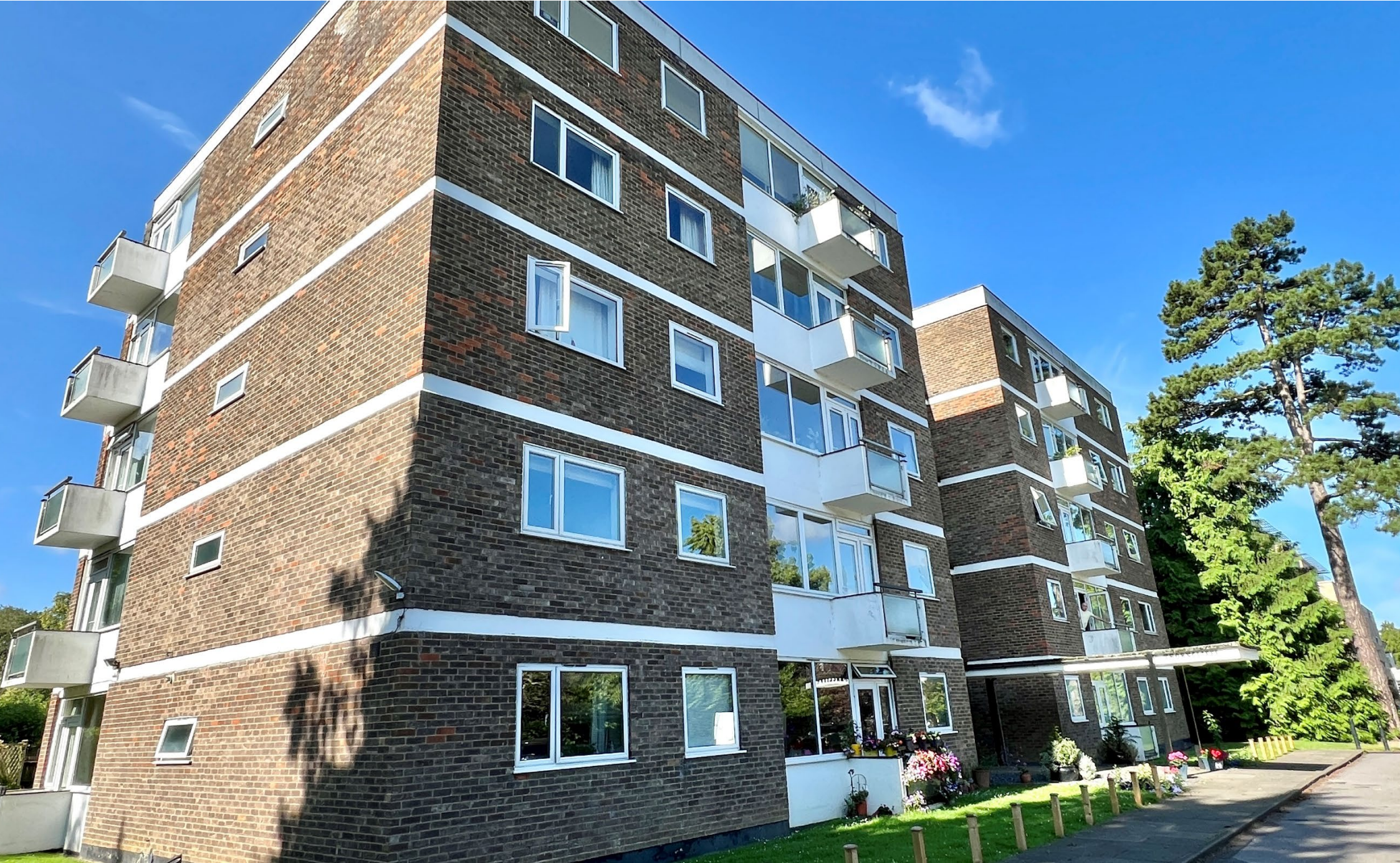
23 Thorncliffe Flats, Lansdown Road, Lansdown, Cheltenham GL51 6PZ