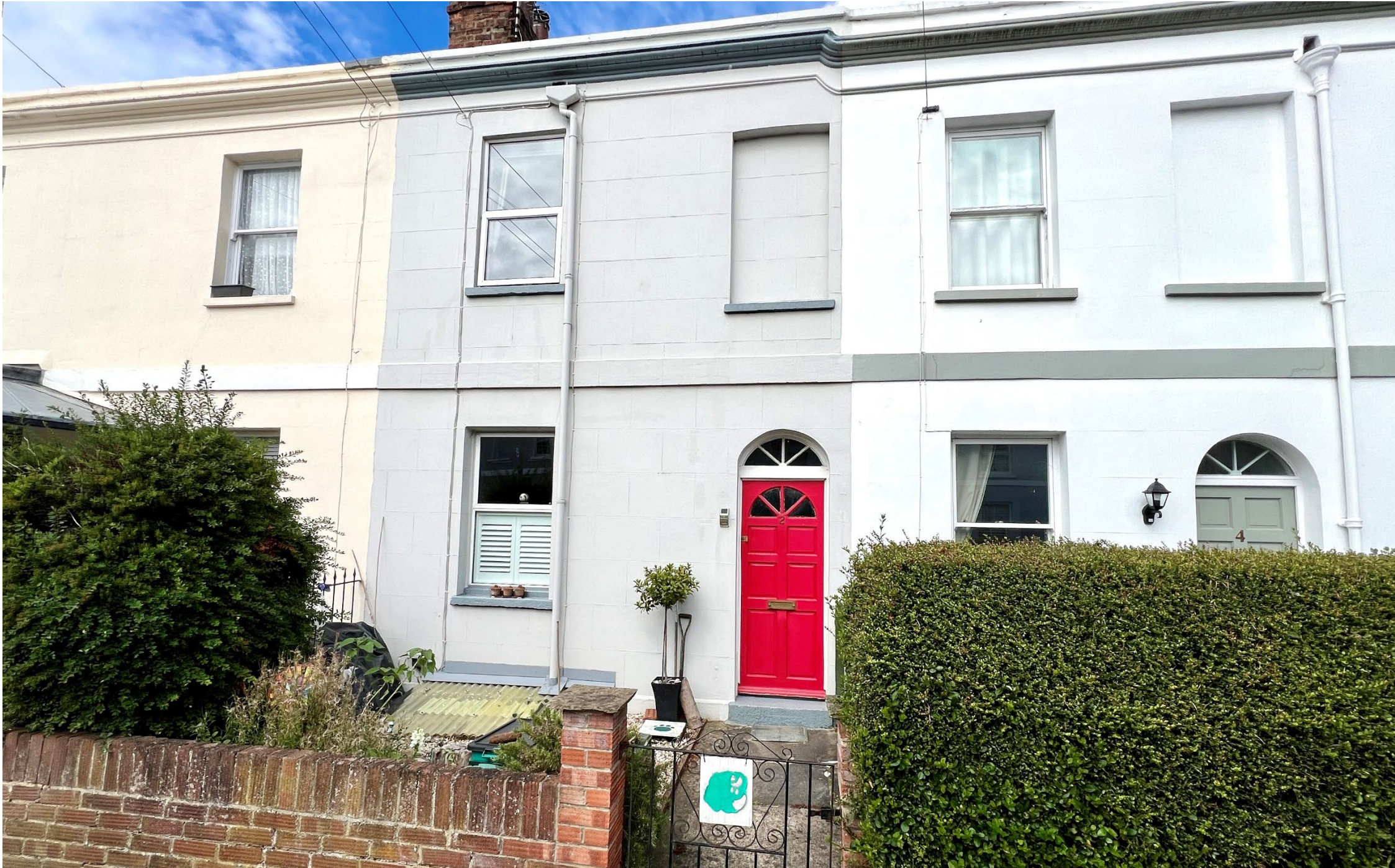
2 Victoria Place, Fairview, Cheltenham, Gloucestershire GL52 2ES