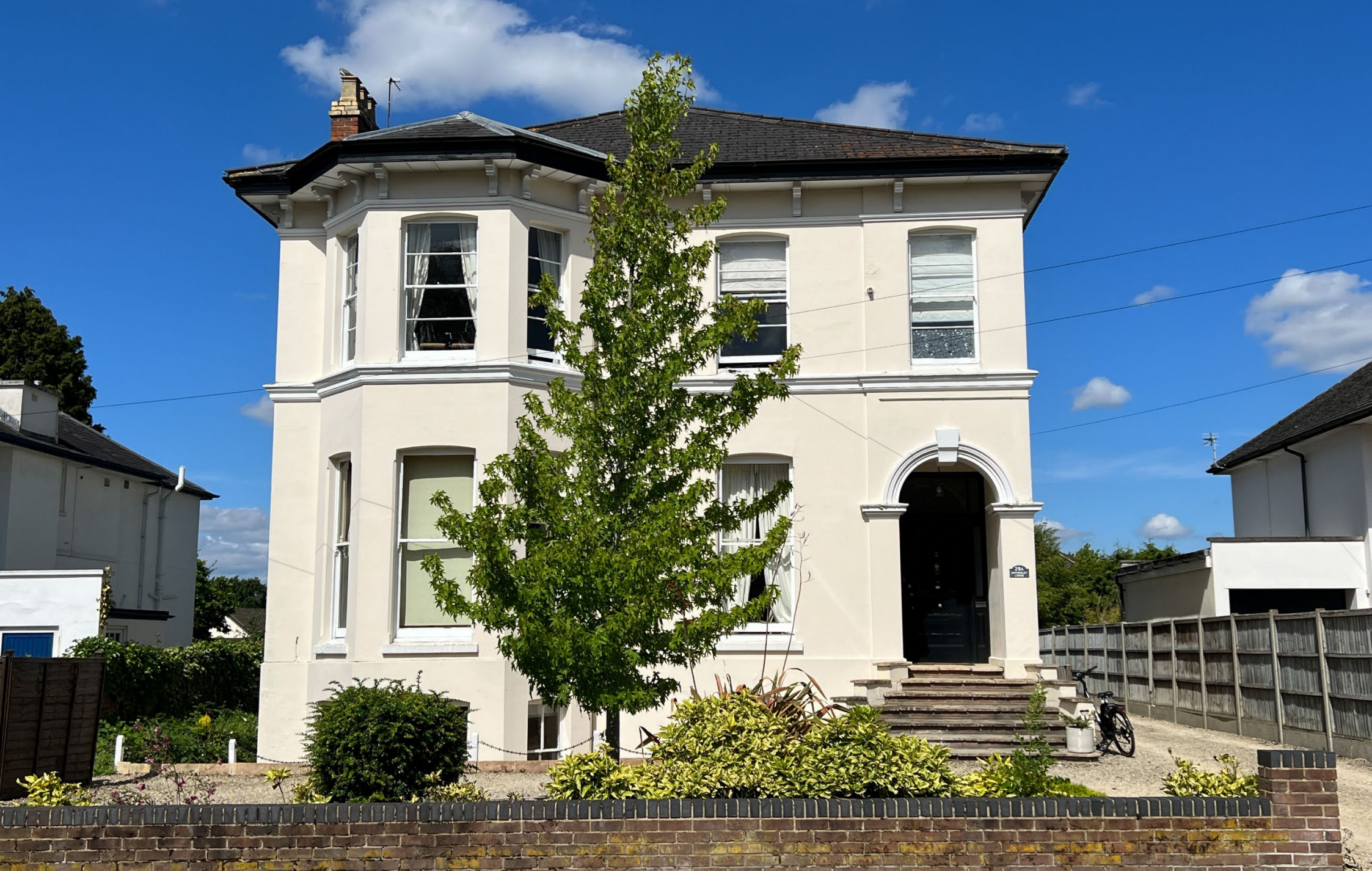
Flat 3 Hatherley Lodge, 29a St Stephens Road, Tivoli, Cheltenham GL51 3AB