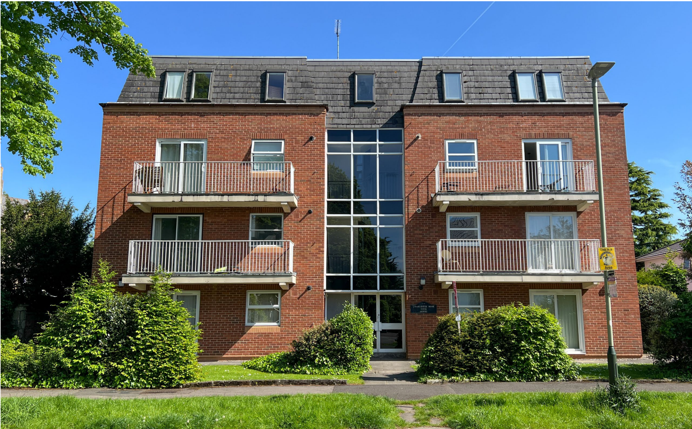
8 Charlotte Rose House, Christchurch Road, Lansdown, Cheltenham GL50 2PB