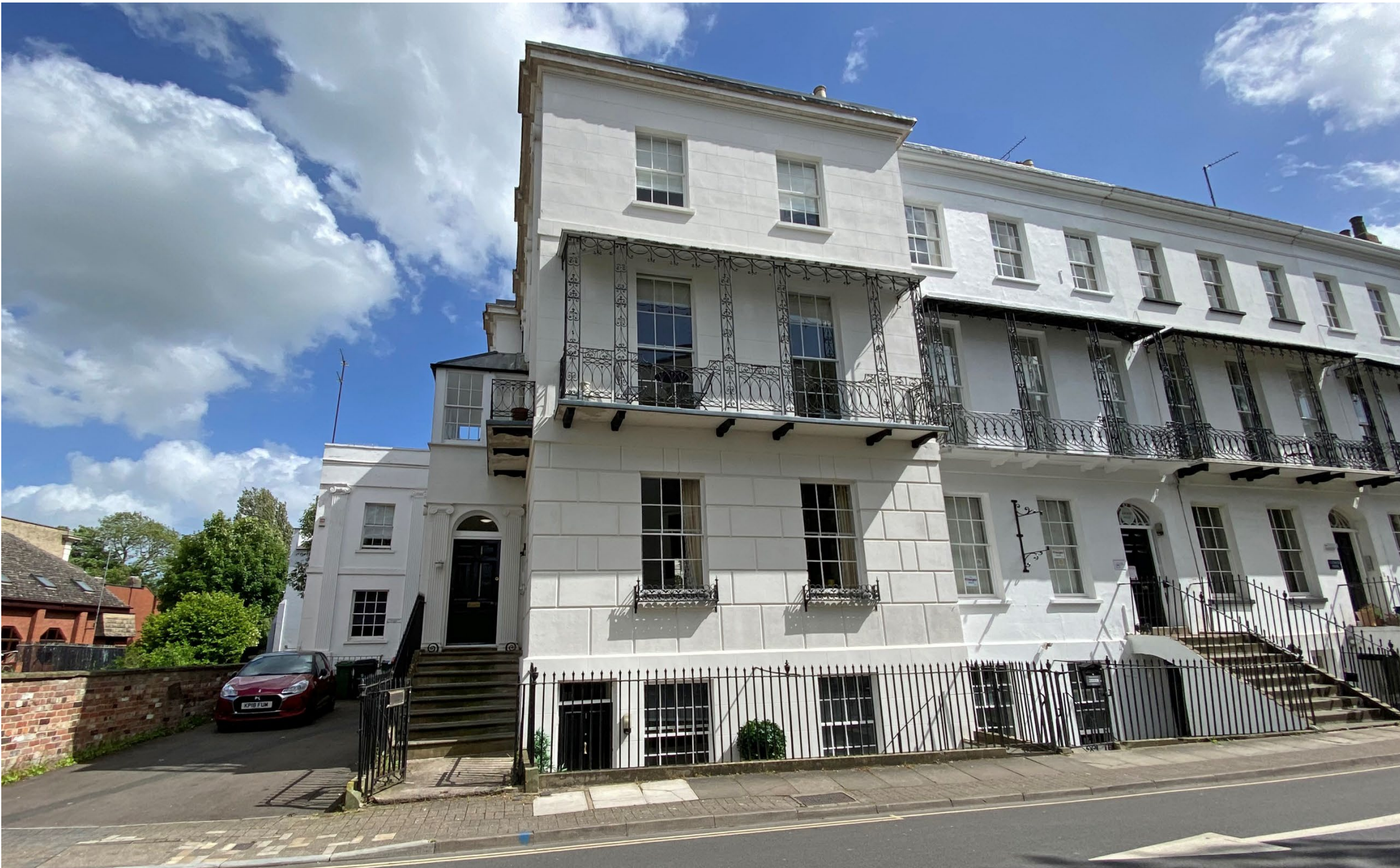
Flat 5 Buckingham House, Wellington Street, Cheltenham GL50 1XY