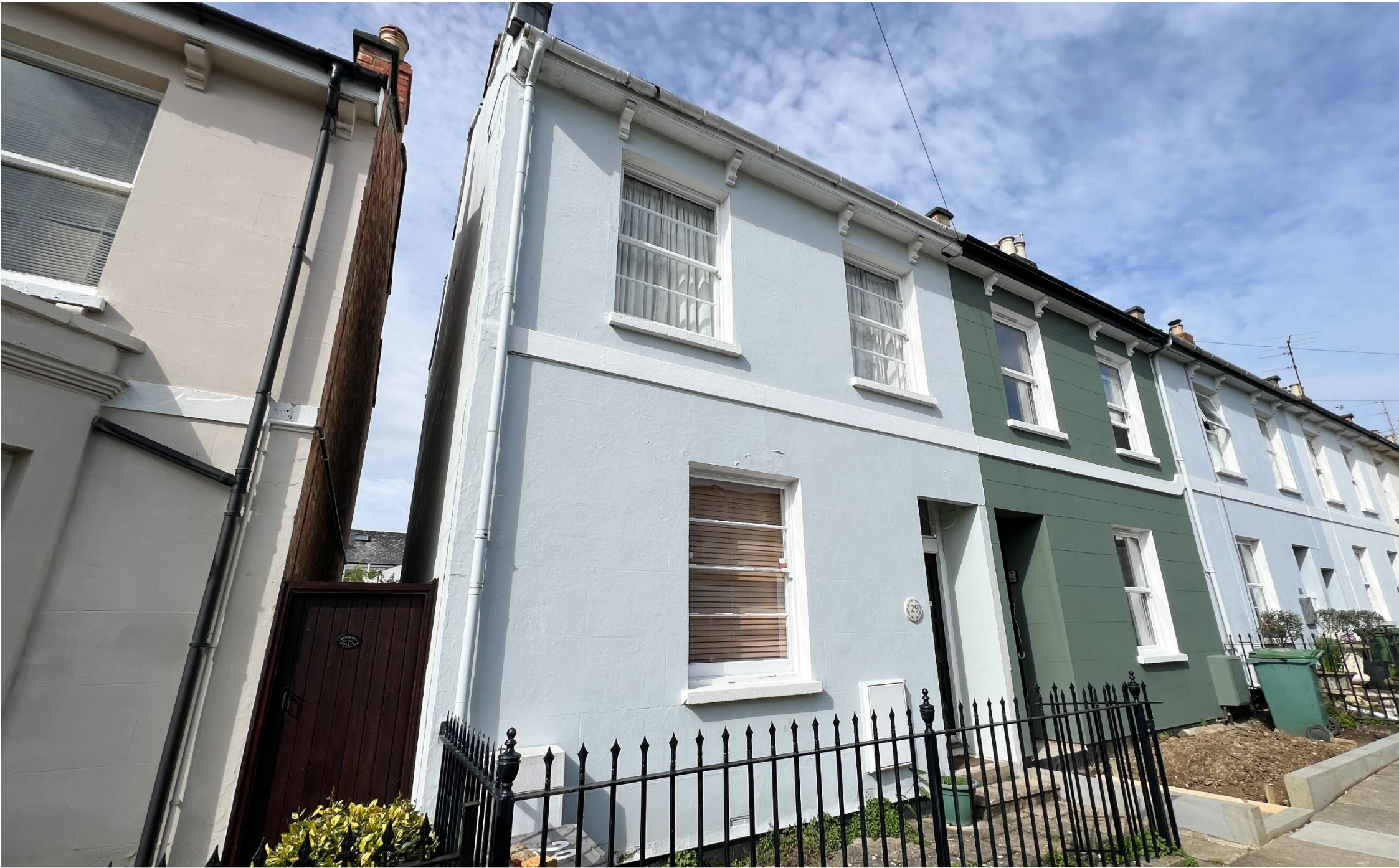
29 Alexandra Street, Tivoli, Cheltenham GL50 2UQ