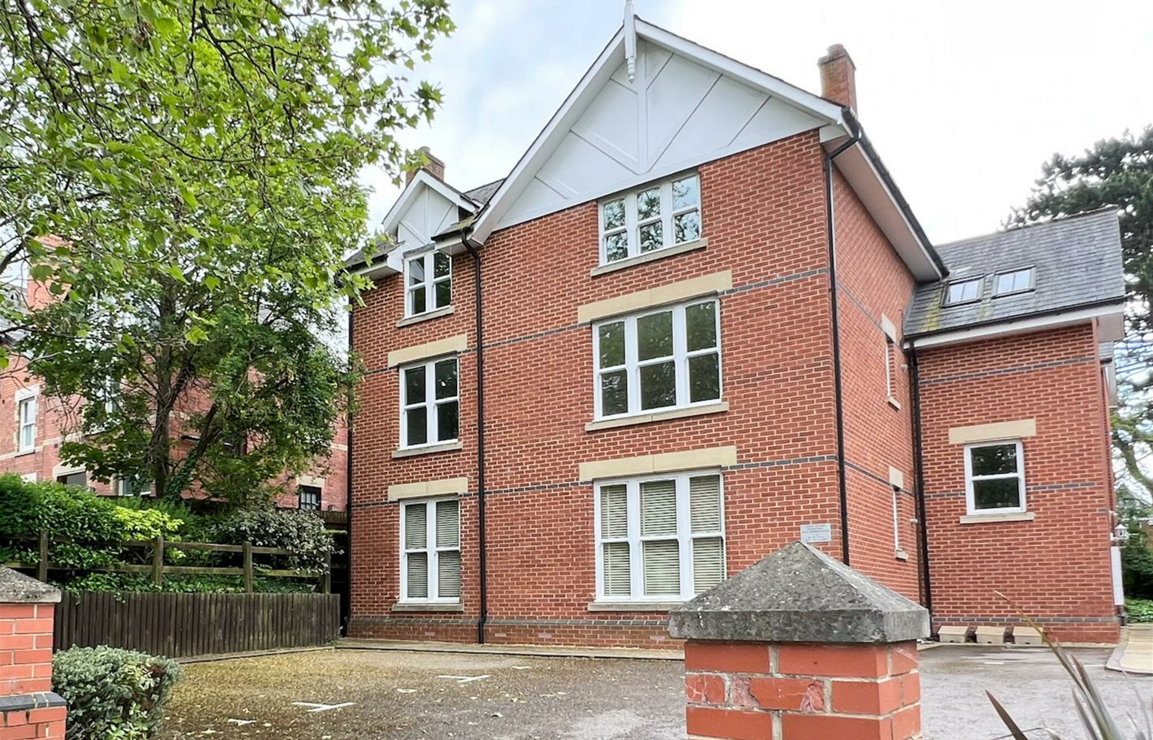
Flat 4 Hazelhurst, 24 Eldorado Road, Cheltenham, Gloucestershire, GL50 2PT