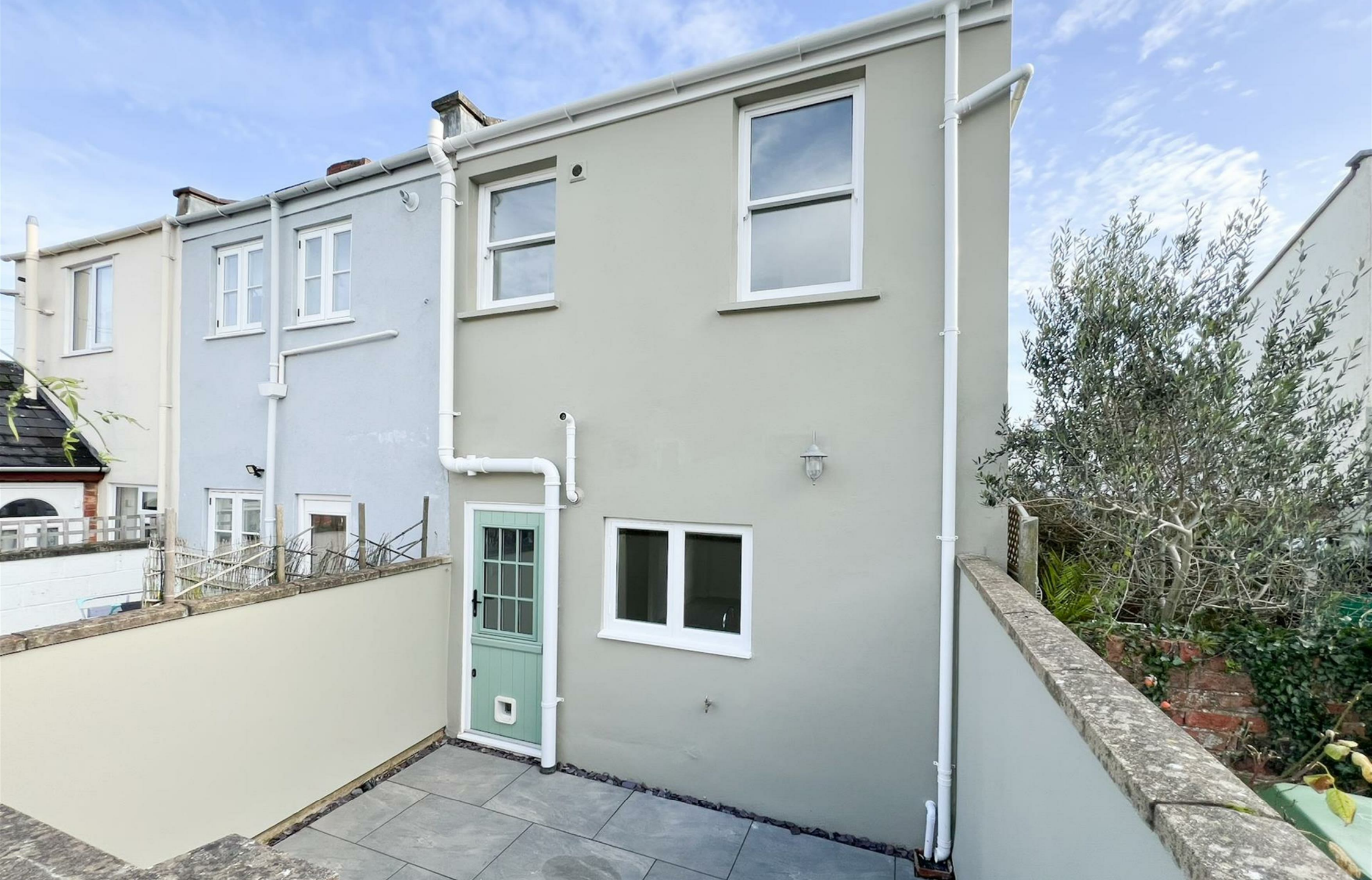
3 Fairlight Cottages, Hatherley Street, Cheltenham, GL50 2TT