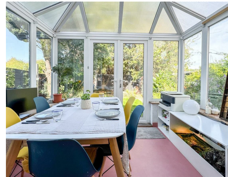
living room 13'9" x 13'5"