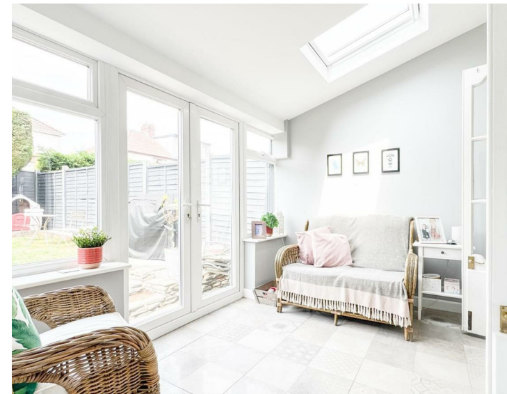
living room 13'5" x 11'1"