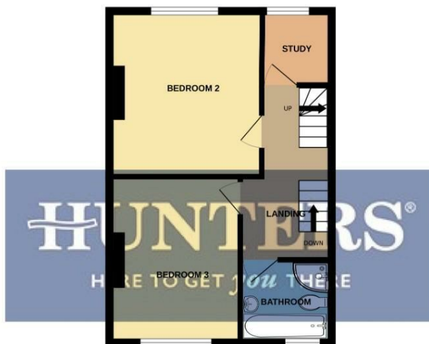
1ST FLOOR 378 sq.ft. (35.1 sq.m.) approx.