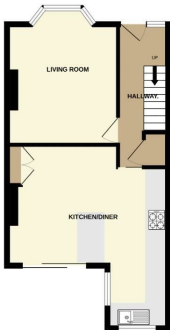
GROUND FLOOR 424 sq.ft. (39.4 sq.m.) approx.