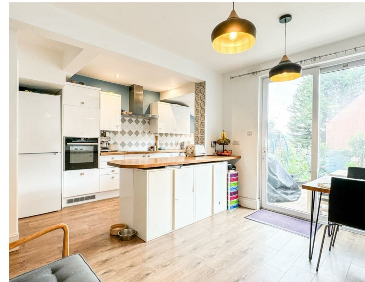
living room 11'11" x 11'1"