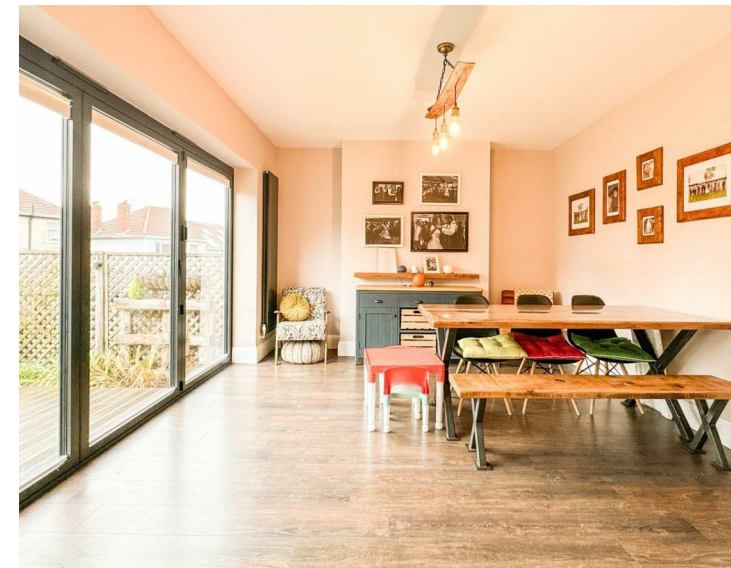
living room 12'0" x 11'7"