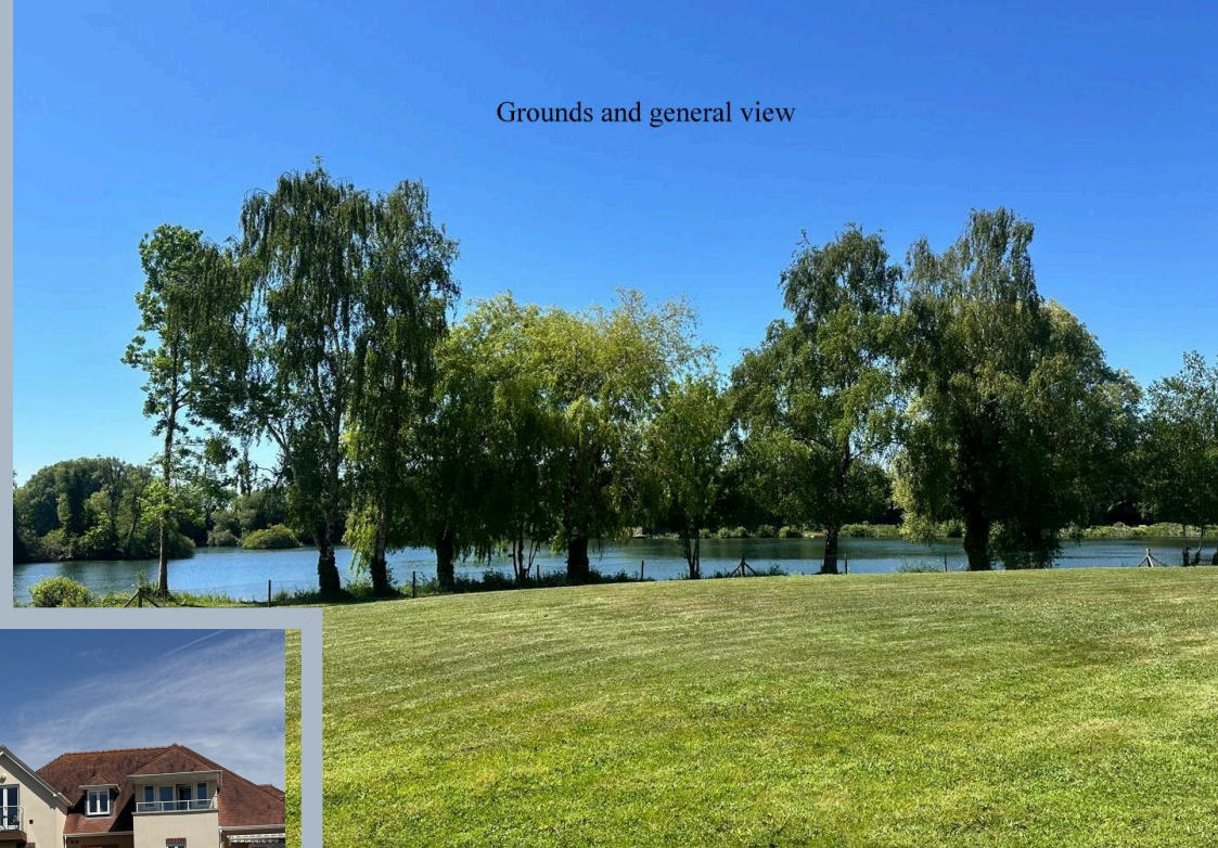
Grounds and general view