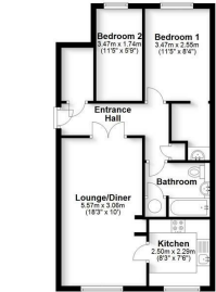
Total area: approx. 57.0 sq. metres (613.3 sq. feet) For information only, not a contract. Plan produced using PlanIt.