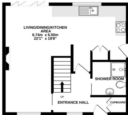
GROUND FLOOR 51.9 sq.m. (558 sq.ft.) approx.