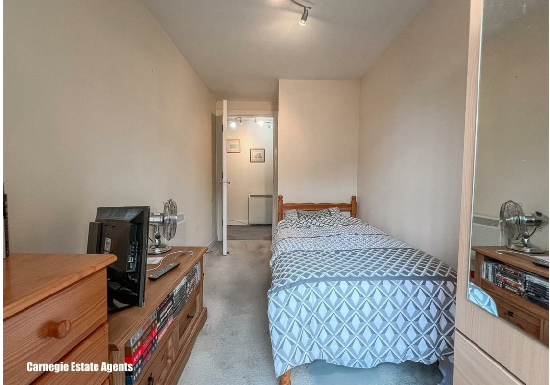
Carnegie Estate Agents