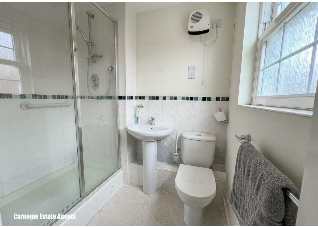
Carnegie Estate Agents