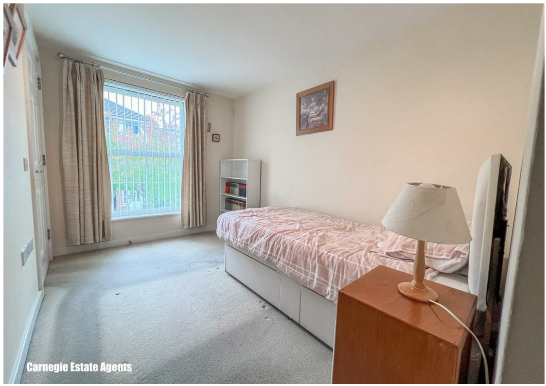
Carnegie Estate Agents