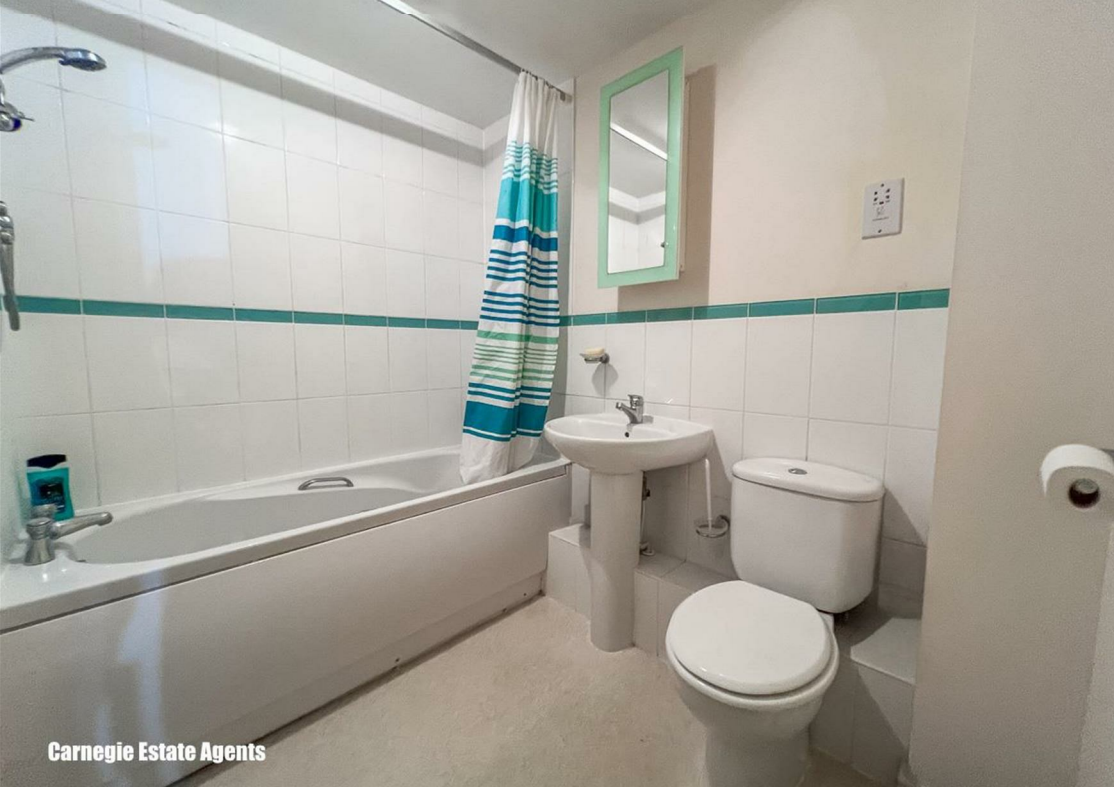
Carnegie Estate Agents