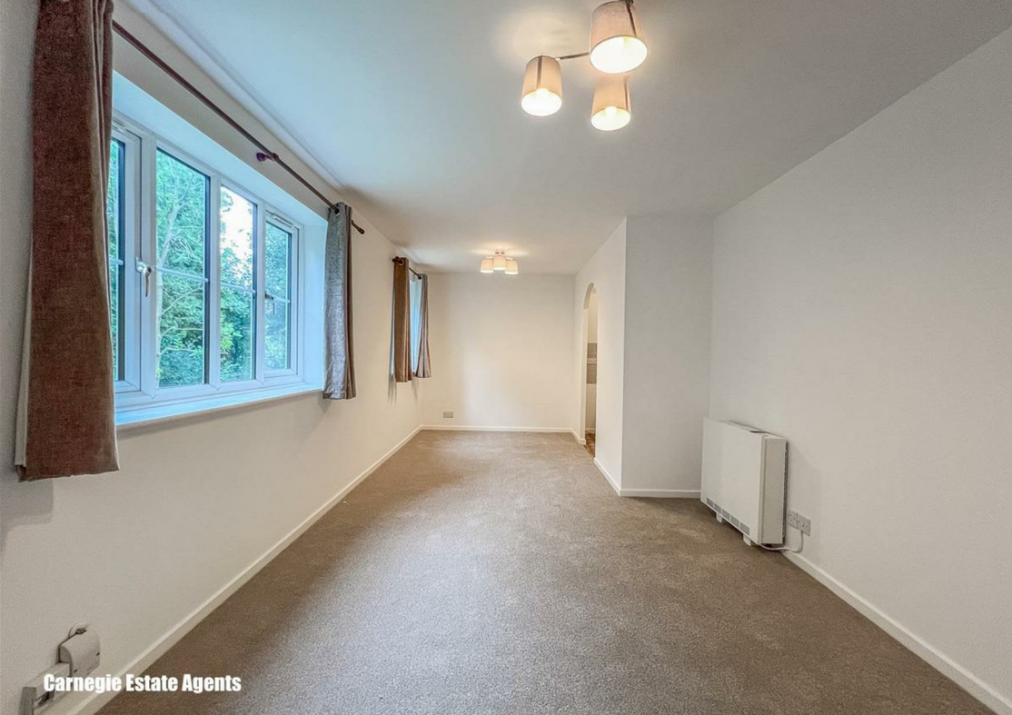
Carnegie Estate Agents