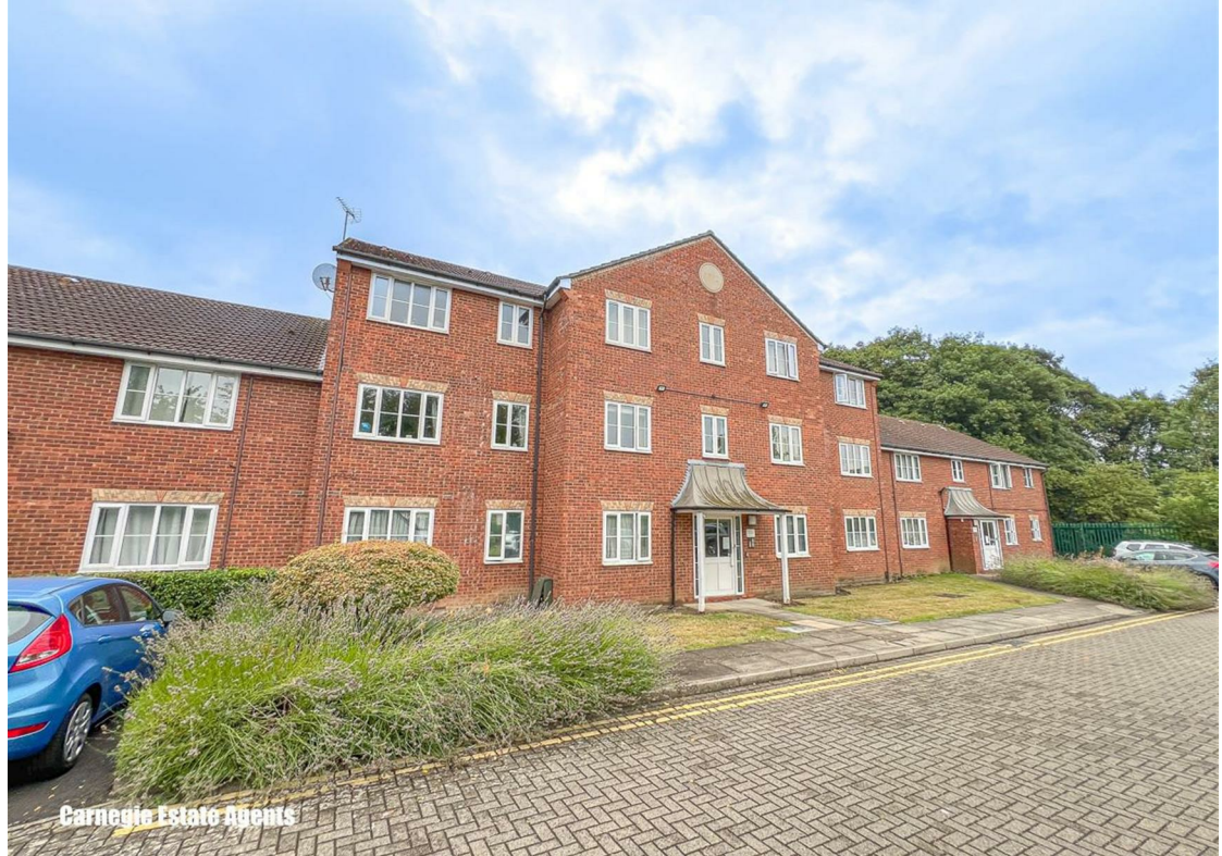
Carnegie Estate Agents