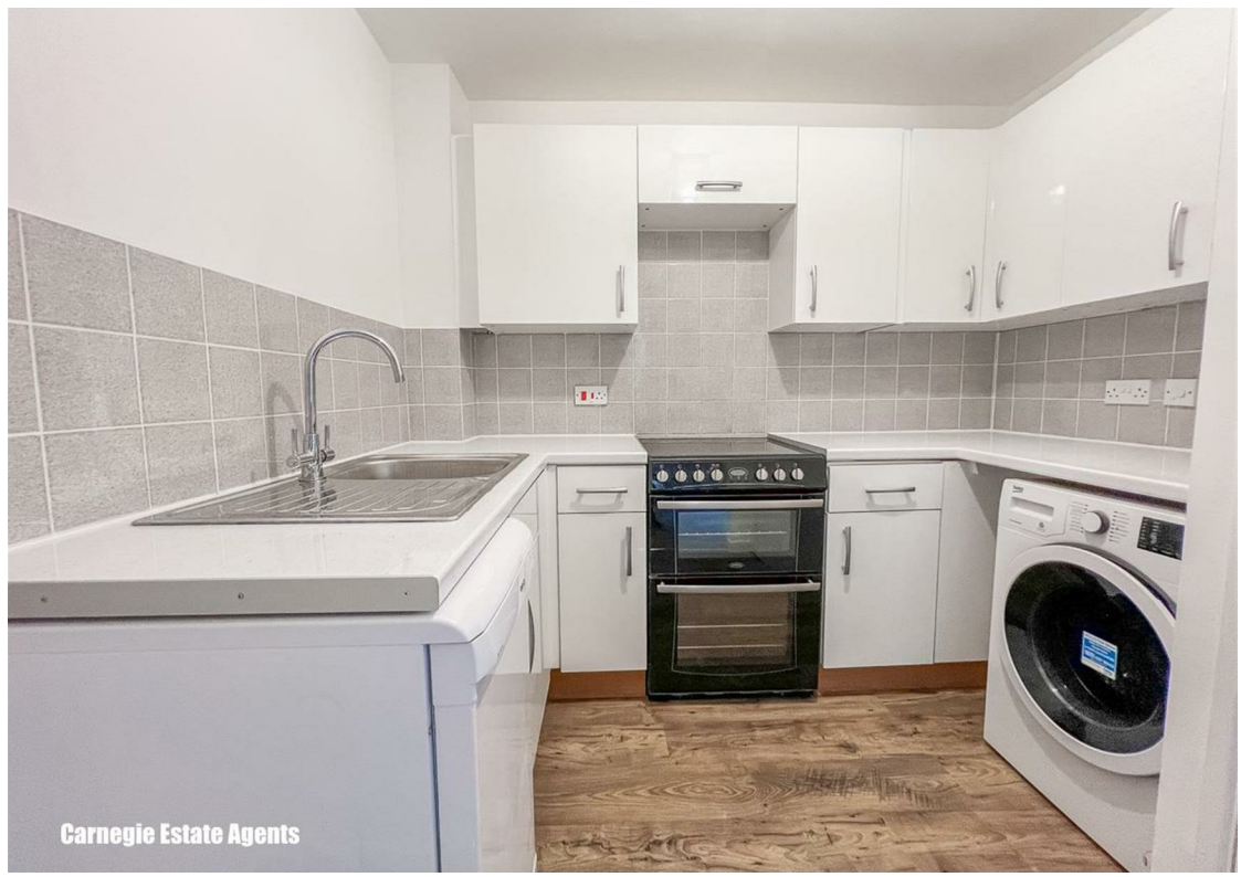
Carnegie Estate Agents