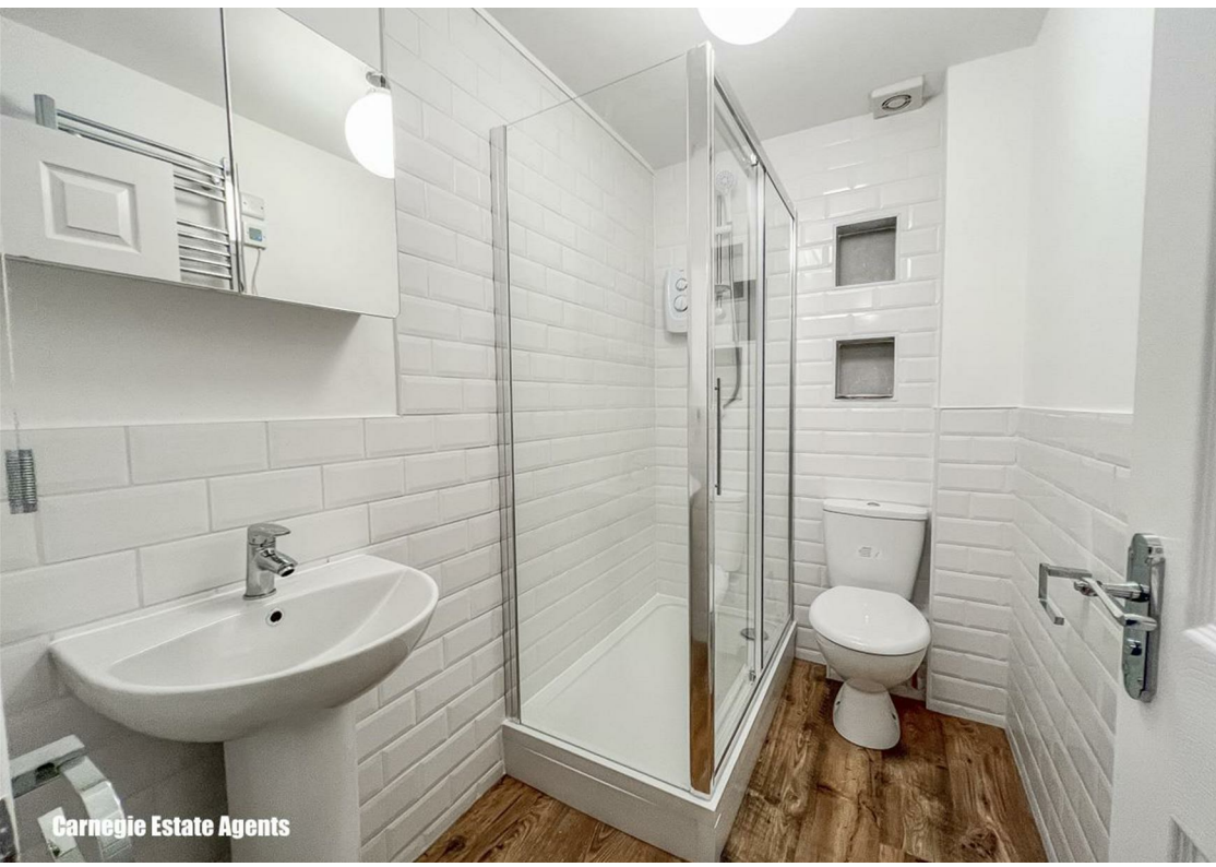
Carnegie Estate Agents