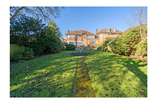
EPC Rating = D Council tax band = H (subject to confirmation)

Floor plan produced in accordance with RICS Property Measurement Standards incorpo International Property Measurement Standards (IPMS2 Residential). @nkchecom 2024. Produced for Grimshaw & Co. REF: 1079155