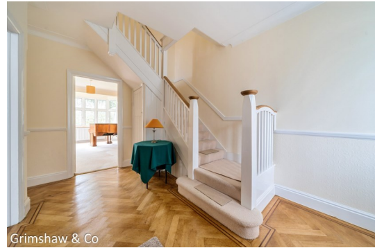
Grimshaw & Co