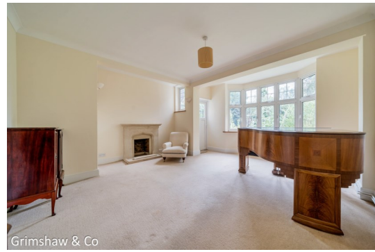
Grimshaw & Co