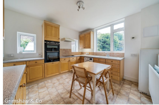
Grimshaw & Co