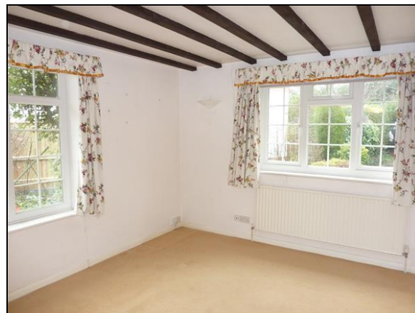
DINING ROOM/OCCASIONAL BEDROOM

By appointment through the Agents on Grimsby 311000. A video walkthrough video tour with commentary can be seen on Rightmove and the Martin Maslin website.