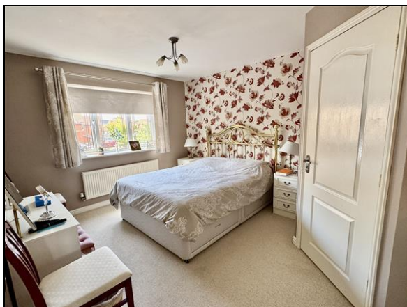
PRINCIPAL BEDROOM ONE