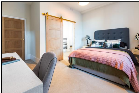
SHOW HOME/APARTMENT 1