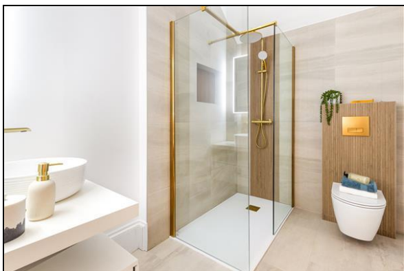
SHOW HOME/APARTMENT 1