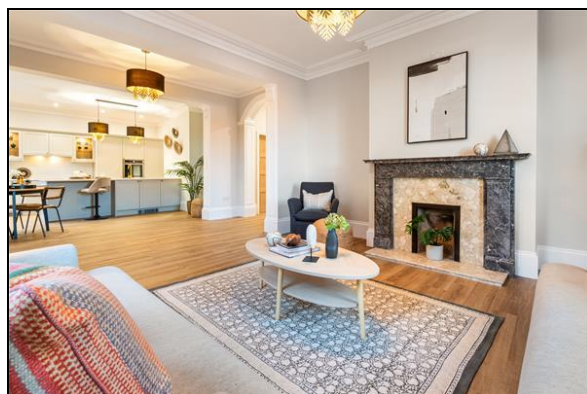
SHOW HOME/APARTMENT 1