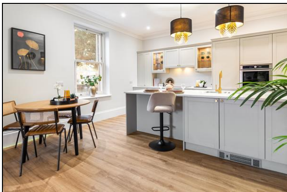
SHOW HOME/APARTMENT 1