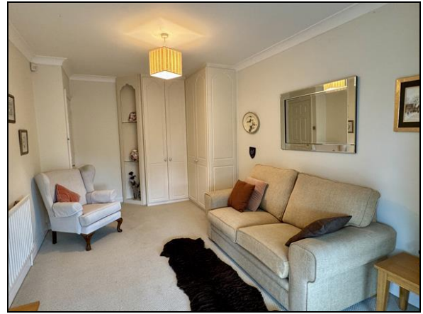
SITTING ROOM/BEDROOM TWO

By appointment through the Agents on Grimsby 311000. A video walkthrough tour with commentary can be seen on Rightmove and the Martin Maslin website.