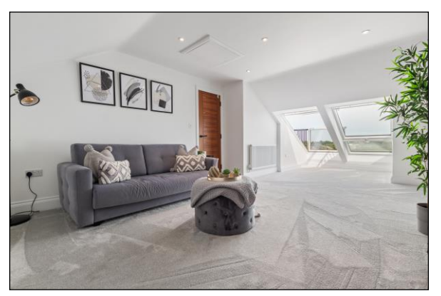
BEDROOM FOUR/SECOND SITTING ROOM

By appointment through the Agents on Grimsby 311000. A video walkthrough tour with commentary can be seen on Rightmove and the Martin Maslin website.