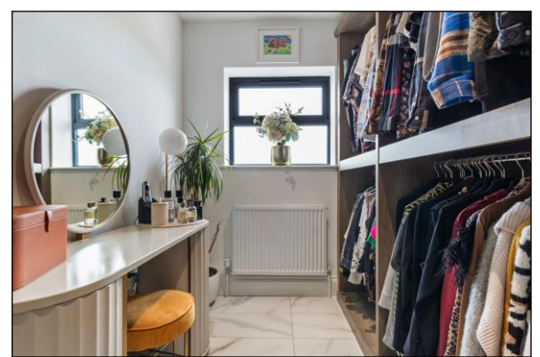
EN-SUITE DRESSING ROOM

The property is approached by an impressive sett paved driveway providing plenty of off road parking. The front garden is laid to lawn with laurel bushes and post and rail fencing to the front boundary. In the Agents opinion the rear garden is equally as impressive as the main house, beautifully landscaped with avant garden imperial paving creating the ultimate al fresco seating area. Paving is symmetrically laid around a neat shaped lawn which has a further private entertaining sunspot behind the Garage complete with a jacuzzi hot tub (available by separate negotiation). The gardens are well screened by modern fencing and provides wonderful views onto the paddock beyond.