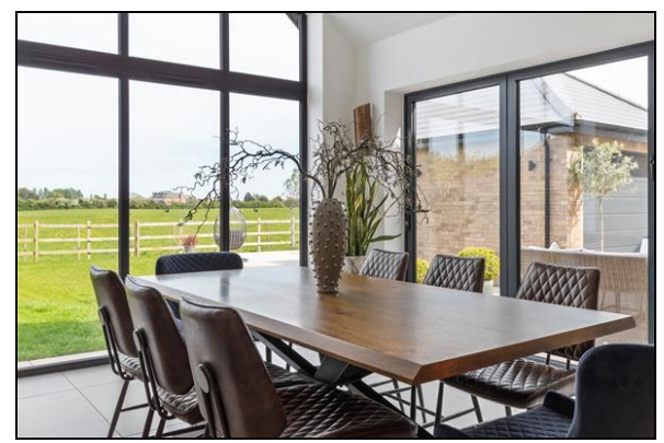
DINING AREA/SUN LOUNGE

A high quality shower room with a designer glass panelled shower with fixed drencher head, chrome heated towel rail, floating vanity with sink bowl and mono tap, and a W.C. It has a tiled floor and a uPVC double glazed side window.