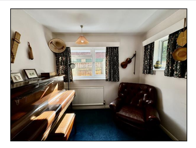
BEDROOM FOUR/SITTING ROOM