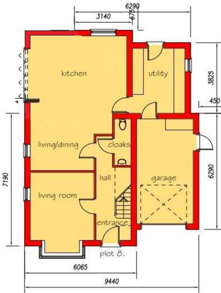
PROPOSED GROUND FLOOR PLAN. scale: 1:100. Plot 8.