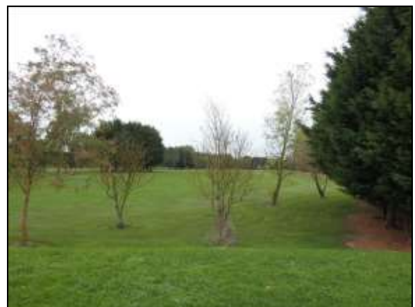
GOLF COURSE VIEWS

By appointment through the Agents on Grimsby 311000. Suitable PPE must be worn on site.