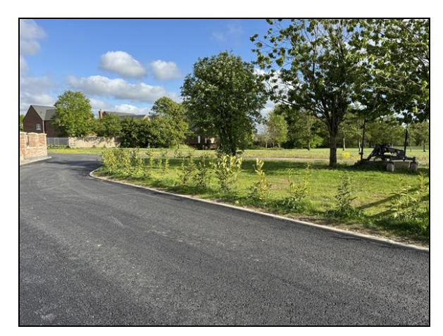
GOLF COURSE VIEWS