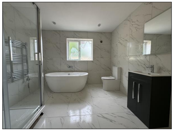
FOR ILLSUTRATIVE PURPOSES ONLY

SERVICES: The services to, and the fittings and appliances within, this property have not been tested and no guarantee can be given as to their condition or suitability for their purpose.