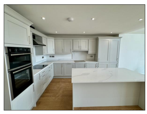
FOR ILLSUTRATIVE PURPOSES ONLY