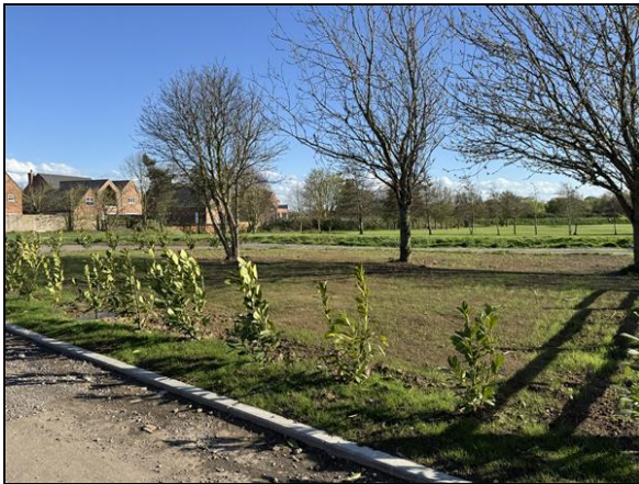
GOLF COURSE VIEWS

SERVICES: The services to, and the fittings and appliances within, this property have not been tested and no guarantee can be given as to their condition or suitability for their purpose.