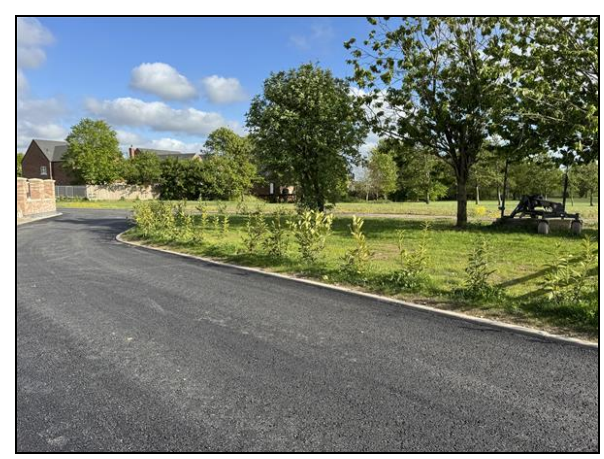
GOLF COURSE VIEW

SERVICES: The services to, and the fittings and appliances within, this property have not been tested and no guarantee can be given as to their condition or suitability for their purpose.