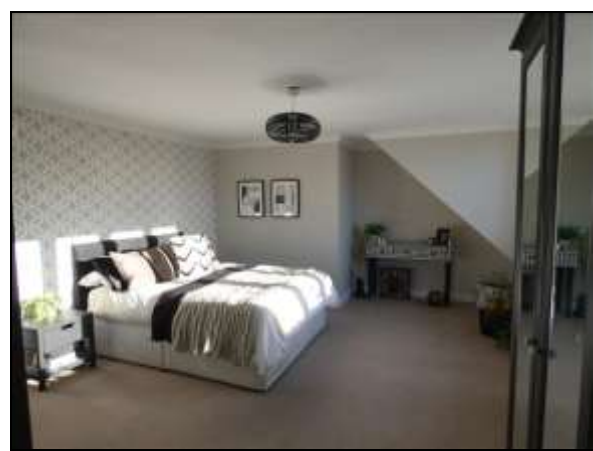
PRINCIPAL BEDROOM SUITE