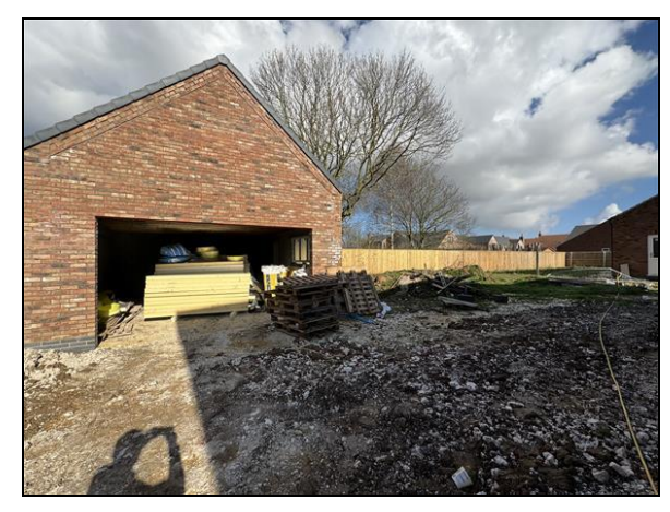
DETACHED DOUBLE GARAGE