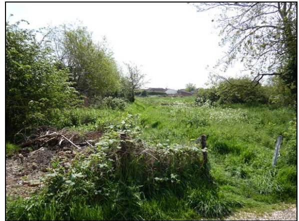
ENTRANCE FROM PRIVATE LANE