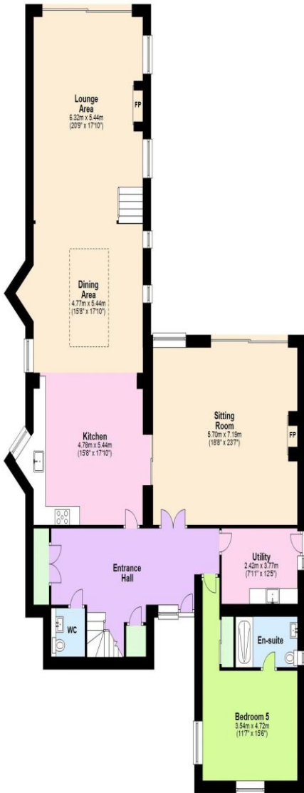
Ground Floor Approx. 246.7 sq. metres (2676.8 sq. feet)