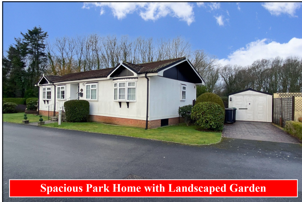
Spacious Park Home with Landscaped Garden

1 Knightcrest Park, Milford Road, Everton, Lymington. SO41 0BA