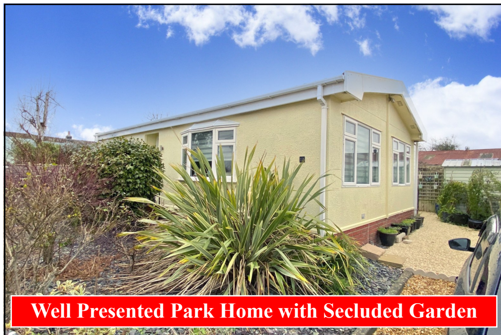
Well Presented Park Home with Secluded Garden

12 Fleur De Lys Park, Pilley, Lymington, Hampshire. SO41 5QJ