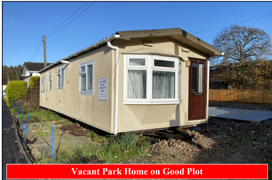
Vacant Park Home on Good Plot

27 Holton Heath Park, Wareham Road, Holton Heath, Poole. BH16 6JS