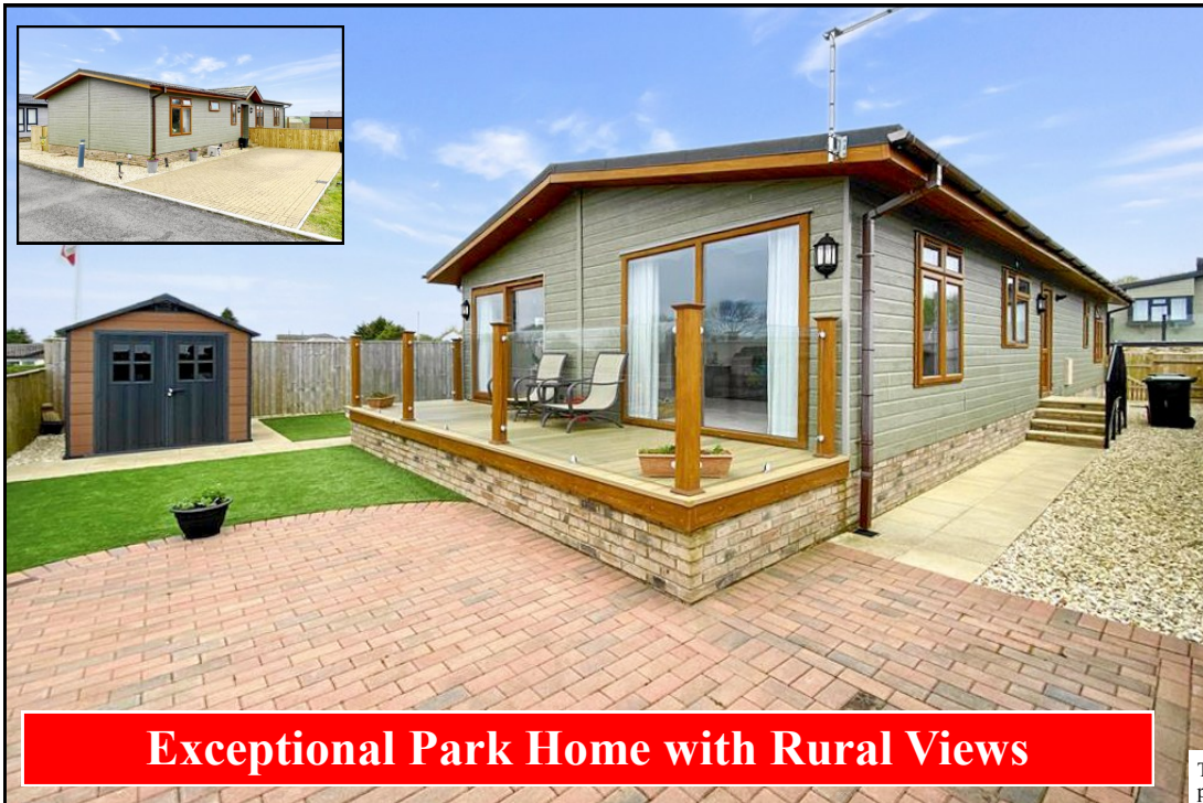
Exceptional Park Home with Rural Views

78 Hardy Country Park, Bridport Road Dorchester. DT2 9DS