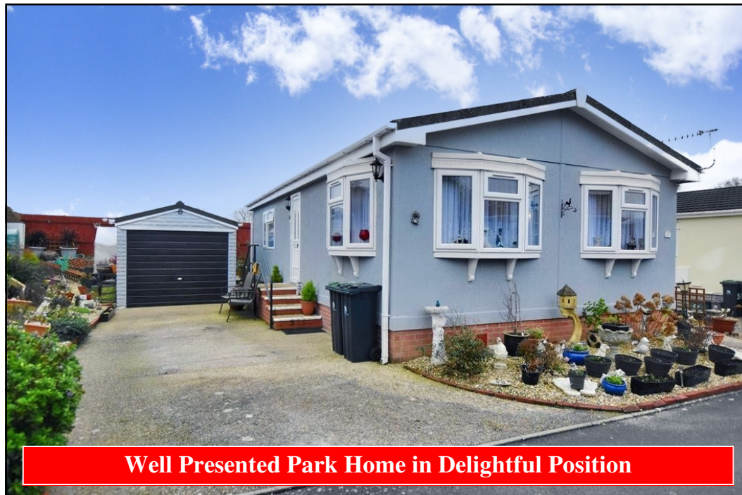
Well Presented Park Home in Delightful Position

55 Oaklands Park, Crossways, Nr Dorchester, Dorset. DT2 8JQ