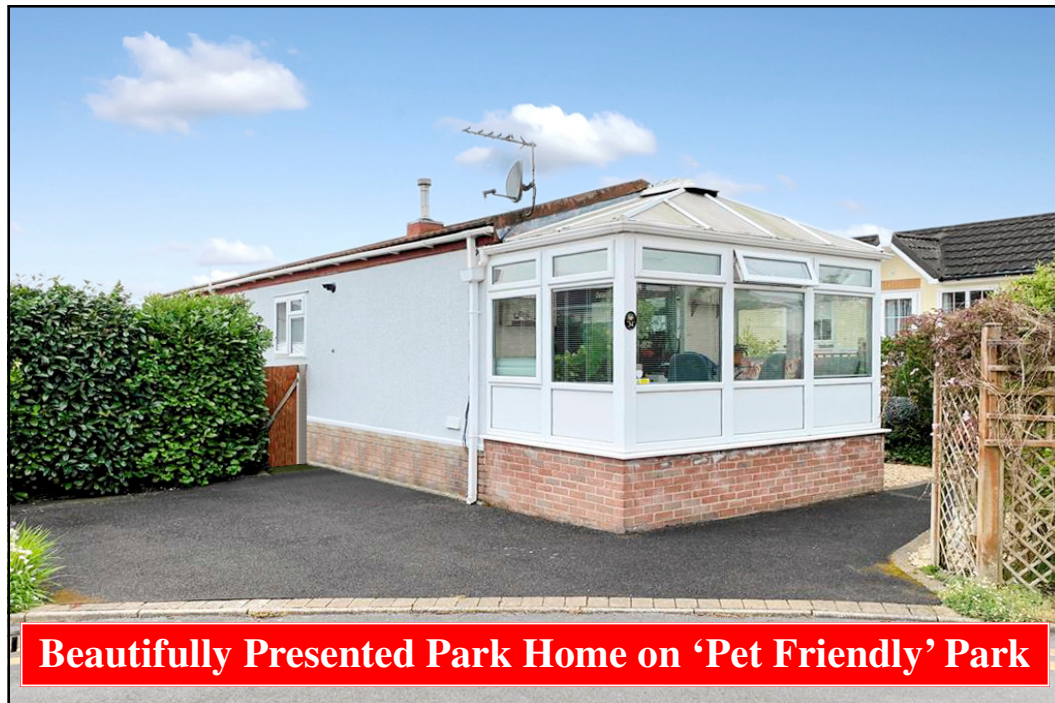
Beautifully Presented Park Home on 'Pet Friendly' Park

34 Pinehurst Park, West Moors, Ferndown, Dorset. BH22 0BW