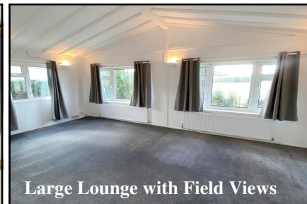
Large Lounge with Field Views