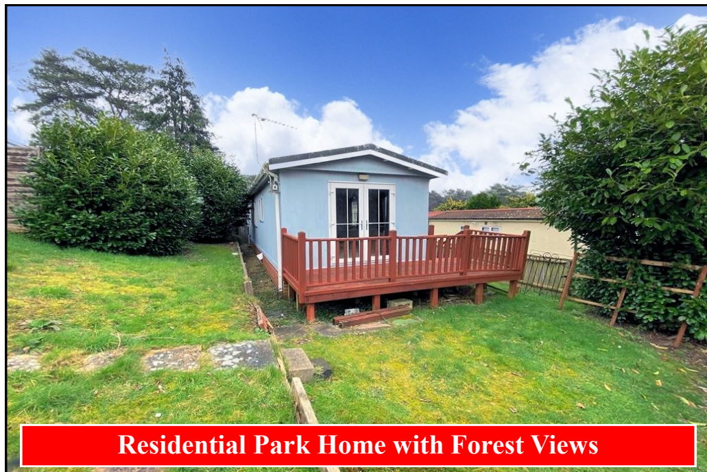
Residential Park Home with Forest Views

47 Sunnyside Park, Ringwood Road, St Ives, Dorset. BH24 2NW