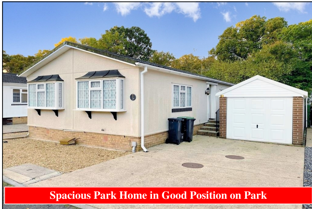
Spacious Park Home in Good Position on Park

61 Dewlands Park, West Close, Verwood, Dorset. BH31 6PR