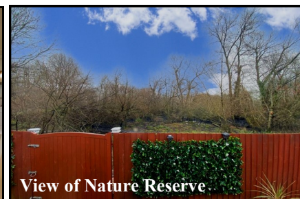
View of Nature Reserve

Pitch Fee: approx £270 per month including water & sewerage Subject to Annual Review Council Tax Band: 'A'