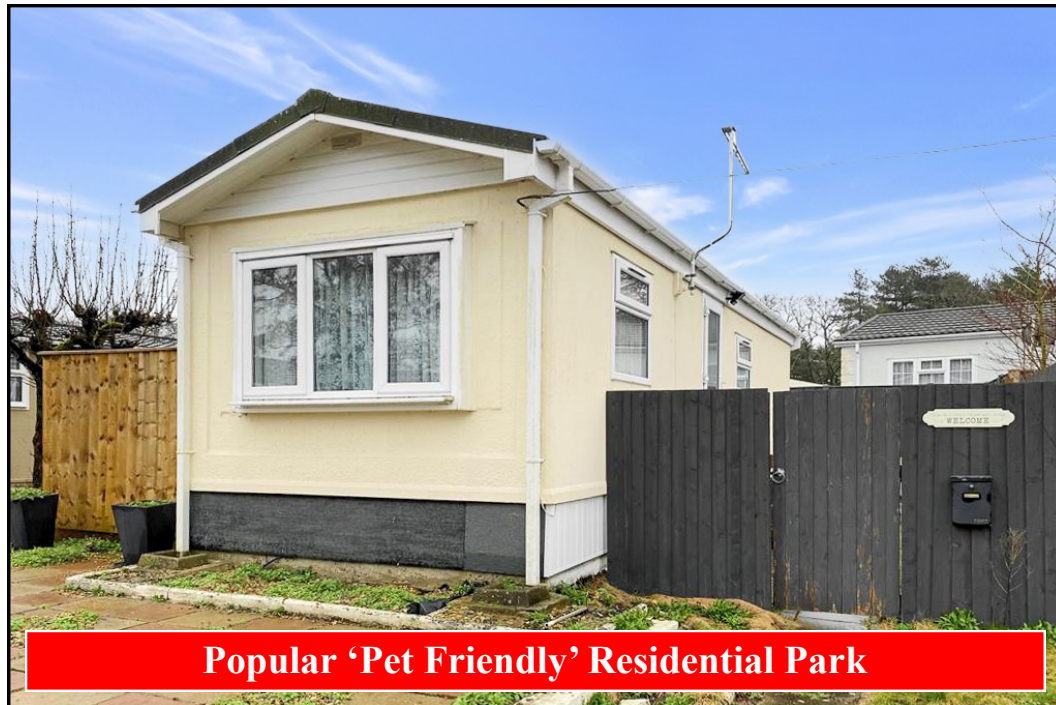
Popular 'Pet Friendly' Residential Park

109 The Square, Oaktree Park, St Leonards, Ringwood. BH24 2RL