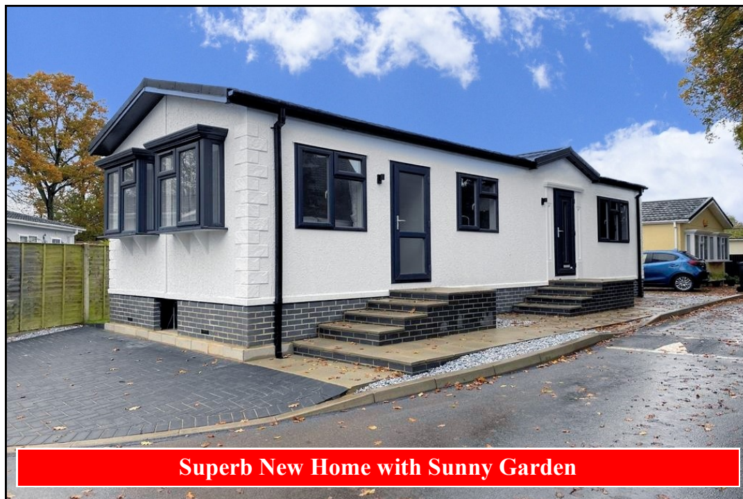
Superb New Home with Sunny Garden

9 Dewlands Park, West Close, Verwood. BH31 6PR