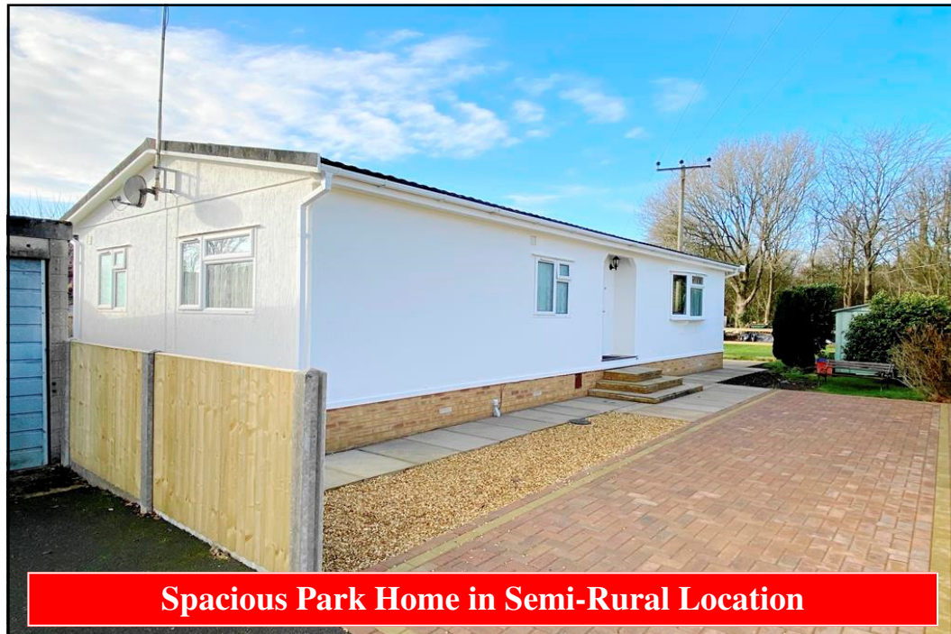
Spacious Park Home in Semi-Rural Location

1 Slepe Park, Dorchester Road, Lytchett Minster, Poole. BH16 6HT