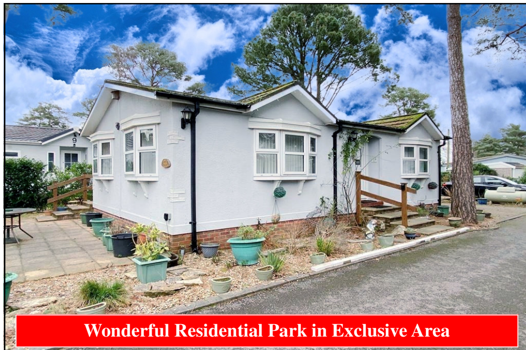
Wonderful Residential Park in Exclusive Area

10 Ark Drive, Lone Pine Park, Lone Pine Drive, Ferndown. BH22 8NB