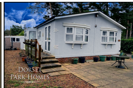
DORSET PARK HOMES