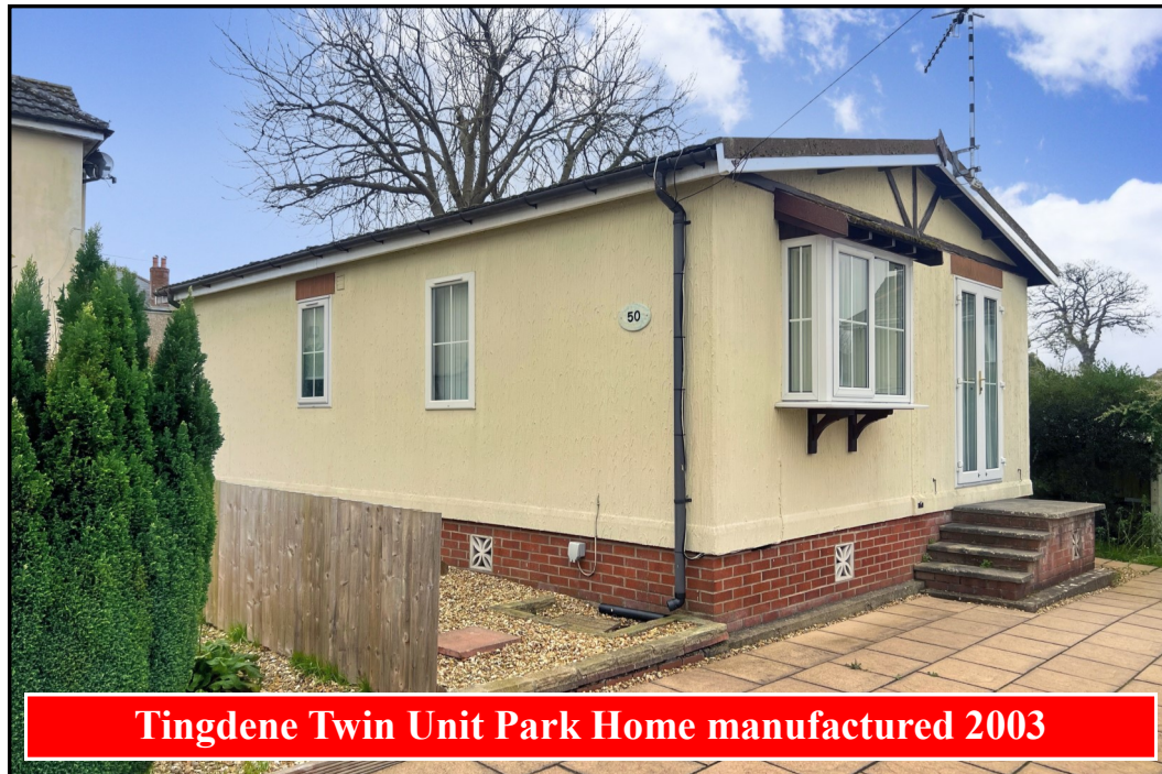
Tingdene Twin Unit Park Home manufactured 2003

50 Doveshill Park, Barnes Road, Ensbury Park, Bournemouth. BH10 5AJ