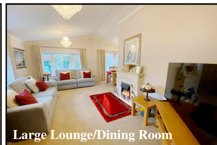
Large Lounge/Dining Room