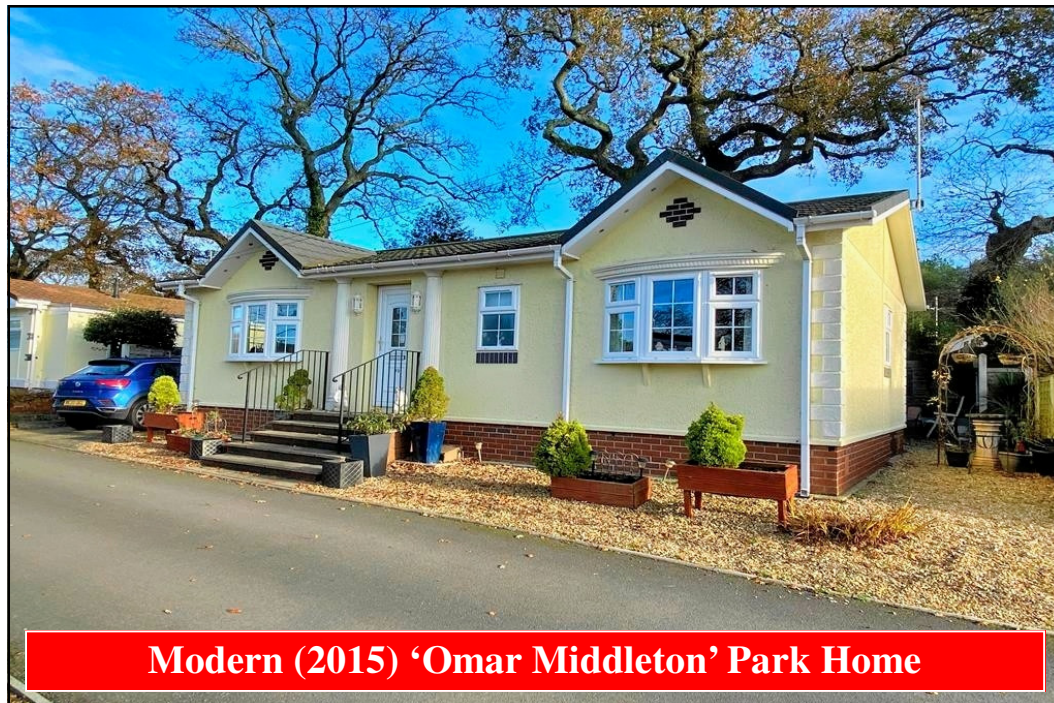
Modern (2015) 'Omar Middleton' Park Home

99 The Crescent, Oaktree Park, St Leonards, Ringwood. BH24 2RP